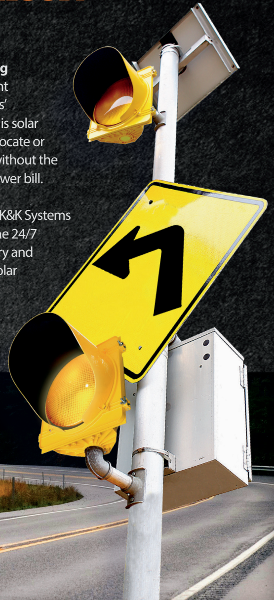
Shown with optional signage and Round Aluminum Crash Tested Pole

A Clean and Clutter-Free Control Box. K&K Systems utilizes just 2 components to operate the 24/7 Flashing Beacon Series – a sealed battery and the K&K Systems' compact all-in-one solar controller, the SPLasher™. Our design retrofits easily to any existing sign with worry-free maintenance.