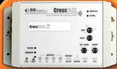
CrossTalk SA-4 Advanced Lighting Controller