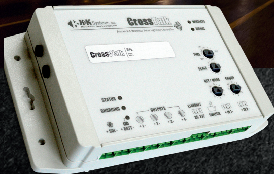
CrossTalk Advanced Lighting Controller